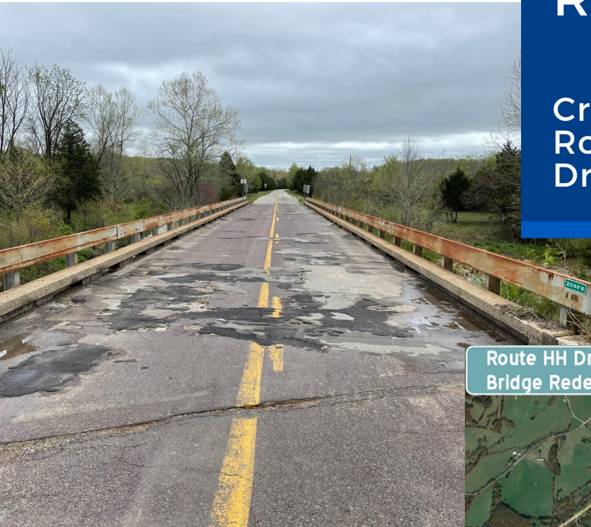
Route HH Dry Creek Bridge Redeck

Crawford County Route HH Dry Creek Bridge