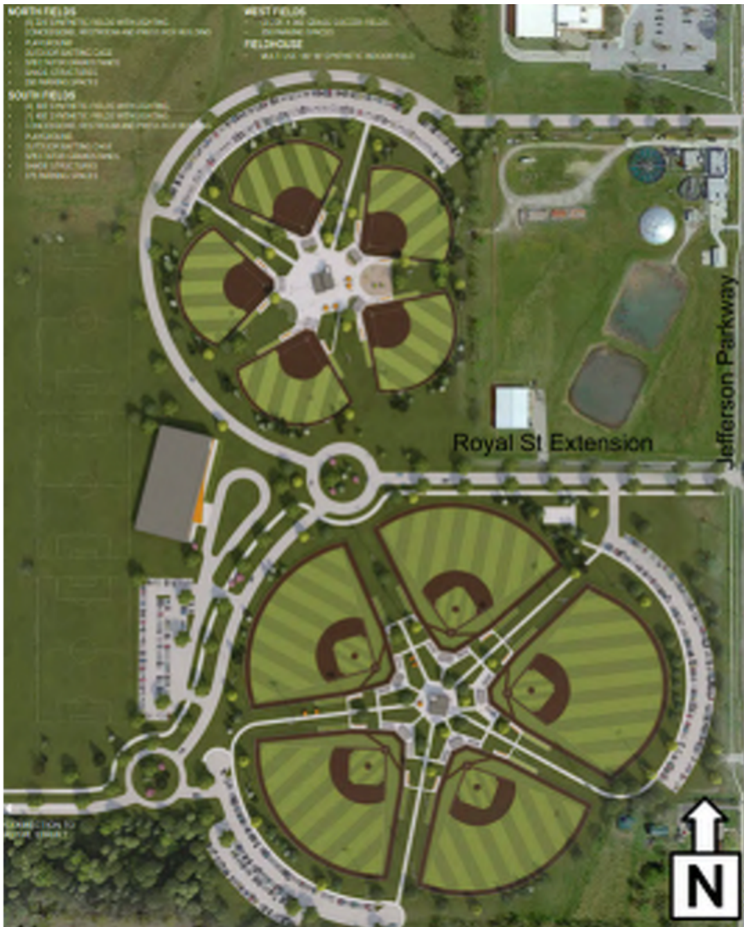
FIGURE 2 - NORTH PARK MASTER PLAN MAP

MoDOT Project SNS0021 - City Project 2022-04