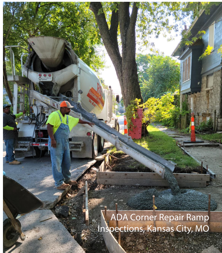
ADA Corner Repair Ramp Inspections, Kansas City, MO

VSM is performing construction observation and inspection services for the City of Kansas City, Missouri Public Works Department. Construction activities involve the repair of ADA corner ramps and sidewalk approaches, including demolition, forming of concrete placement, slope checks, and restoration.