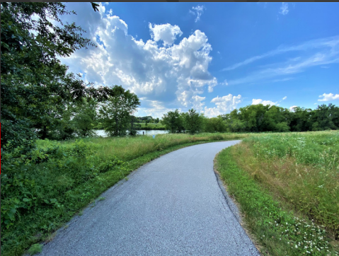
Legacy Park Trails, 3.5 Miles Lee's Summit, MO