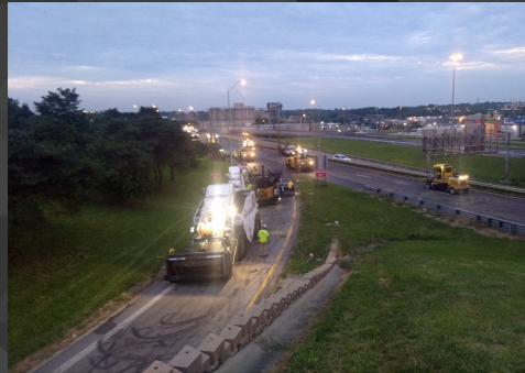
Mill and Overlay of I-70 and 291 MoDOT, Greater KCMO