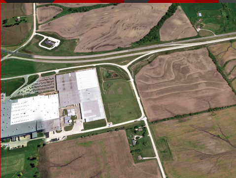
Hwy 71 On-Ramp and 285th Street Improvements, Maryville, MO