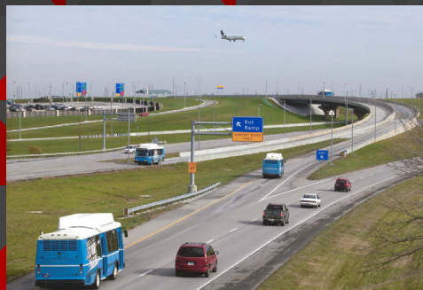
Bus Ramps & Bridges Kansas City International Airport