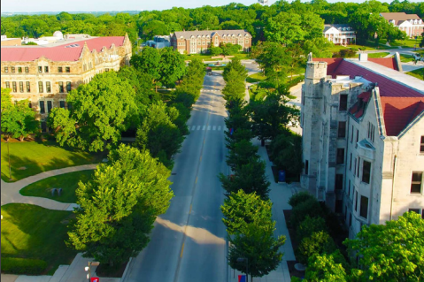
Jayhawk Boulevard Reconstruction University of Kansas, Lawrence, KS