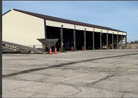
KDOT Subarea Complex Relocation Gardner, KS