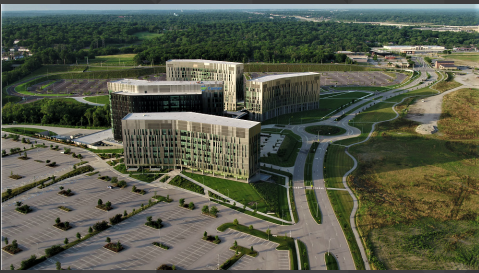
Cerner Innovations, KCMO