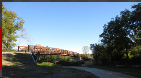
Trolley Trail in Urban Setting Kansas City, MO