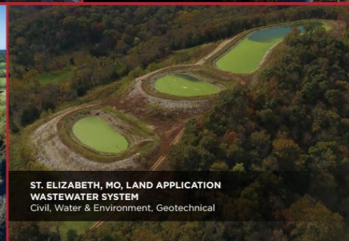
ST. ELIZABETH, MO, LAND APPLICATION WASTEWATER SYSTEM Civil, Water & Environment, Geotechnical