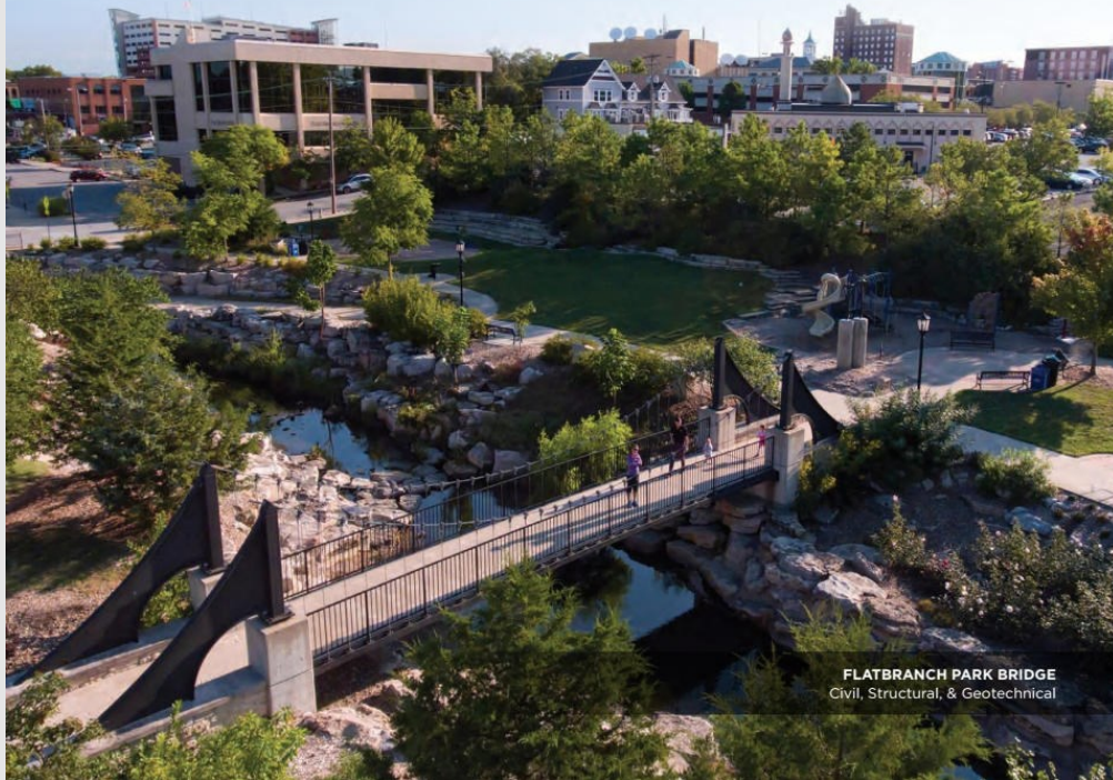
FLATBRANCH PARK BRIDGE Civil, Structural, & Geotechnical

Allstate Consultants LLC (Allstate) is a full-service civil engineering consulting firm offering design solutions for public and private sector clients across the region. Headquartered in Columbia, Missouri, with offices in Marceline, MO, and Lee's Summit, MO, Allstate partners with clients to assist with all stages of project development, from funding acquisition to planning and design to construction inspection and post project support. Since 1975, Allstate's innovative, solution-based approach has been applied to a full range of projects.