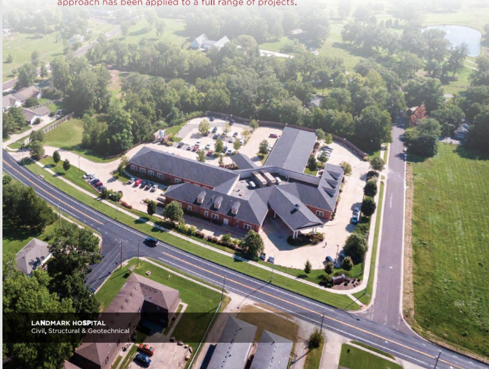
LANDMARK HOSPITAL Civil, Structural & Geotechnical

Allstate Consultants LLC (Allstate) is a full-service civil engineering consulting firm offering design solutions for public and private sector clients across the region. Headquartered in Columbia, Missouri, with offices in Marceline, MO, and Lee's Summit, MO, Allstate partners with clients to assist with all stages of project development, from funding acquisition to planning and design to construction inspection and post project support. Since 1975, Allstate's innovative, solution-based approach has been applied to a full range of projects.