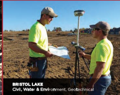
BRISTOL LAKE Civil, Water & Environment, Geotechnical