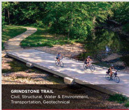
GRINDSTONE TRAIL Civil, Structural, Water & Environment, Transportation, Geotechnical