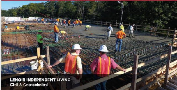
LENOIR INDEPENDENT LIVING Civil & Geotechnical