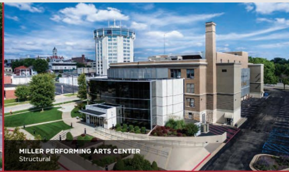
MILLER PERFORMING ARTS CENTER Structural