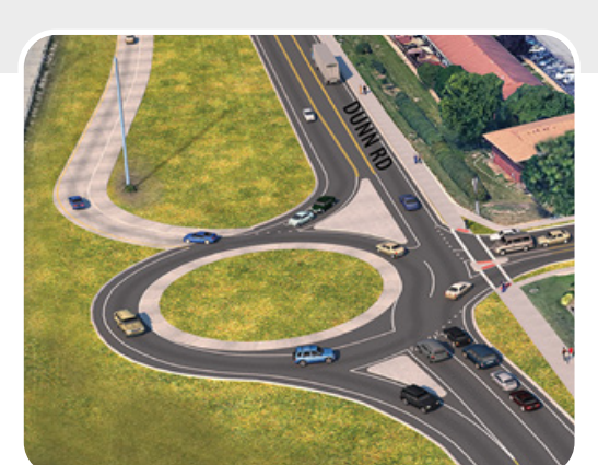
Project: I-270 North Design Build Bellefontaine Roundabout Design

ABNA was also selected for 4 bridge replacement projects as part of MoDOT's Safe & Sound 800 bridge program: Rte. TT Bridge over Slough Creek in Saline County, Rte. M over Bridge Creek in Carroll County, Rte. W over Moniteau Creel in Howard County, and Rte. FE over Edmondson Creek in Saline County. Some of our local agency