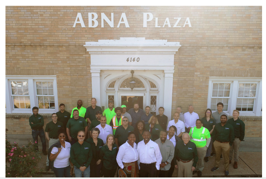
ABNA Engineering, Inc. Headquarters, St. Louis, Missouri

ABNA has a proud history of exceeding client expectations; and it is our goal to position ourselves as a one-stop source for your engineering planning, surveying, design, and construction service needs.