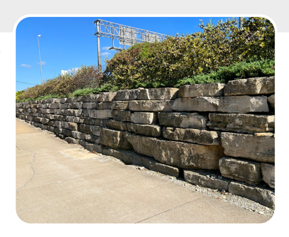
Project: Wall Replacement Design for Great Rivers Greenway Carondelet Connector Pedestrian and Cycling Trail Network in South St. Louis

Additionally, ABNA brings ADA and PROWAG expertise to every project that requires improvements in these areas. Our experience in this area enables us to devise effective solutions for each unique case and design challenge.