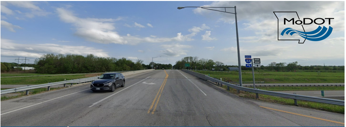
Near Springfield & Republic, Greene County