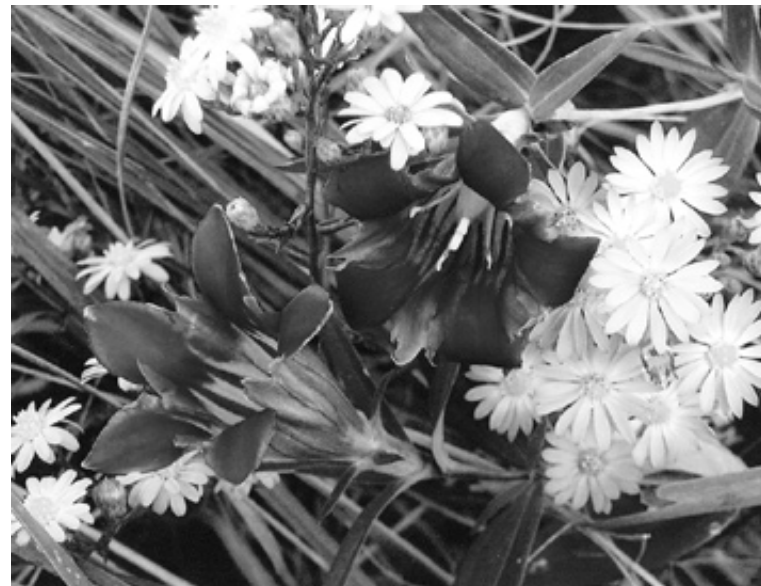
FHWA Photo Opportunity 1st Place

MoDOT took first place in two categories in the Federal Highway Administration Annual Photo Opportunity contest. The contest recognizes organizations for their use of quality photos to increase awareness of roadside issues. This is the fourth consecutive year Missouri has placed first in at least one category.