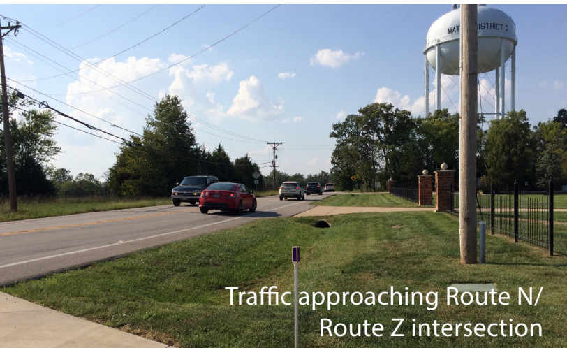
Traffic approaching Route N/ Route Z intersection