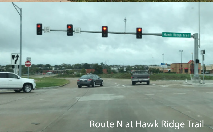
Route N at Hawk Ridge Trail