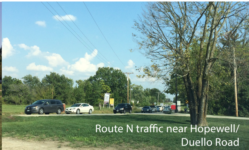
Route N traffic near Hopewell/ Duello Road