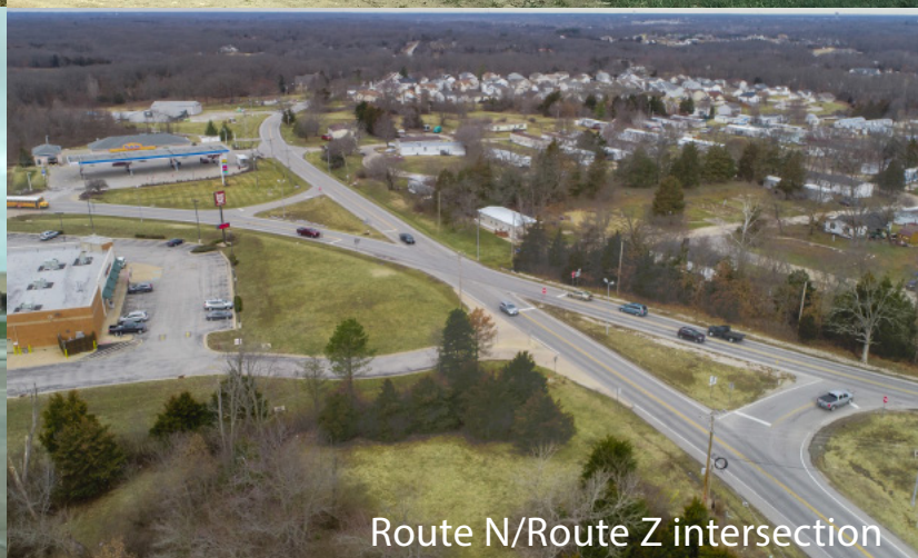
Route N/Route Z intersection