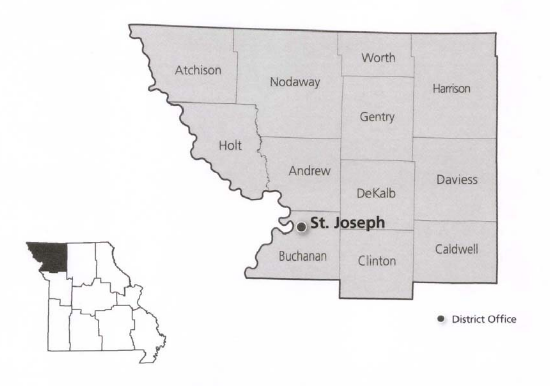
District 1 MoDOT's Northwest District