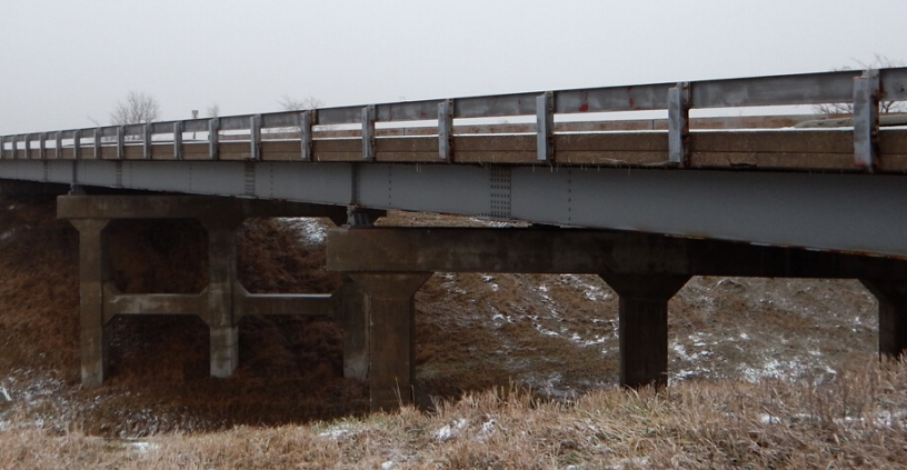
U.S. Route 136 Bridge Built in 1958