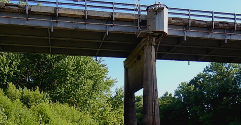
Missouri Route 6 Bridge Built in 1953