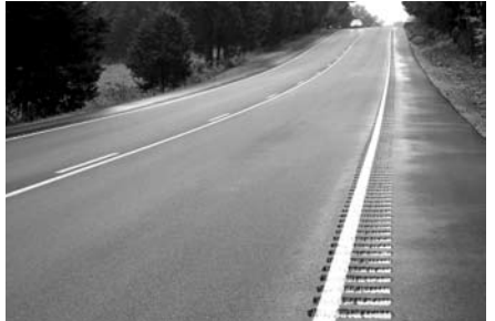
Franklin County road before and after improvements.