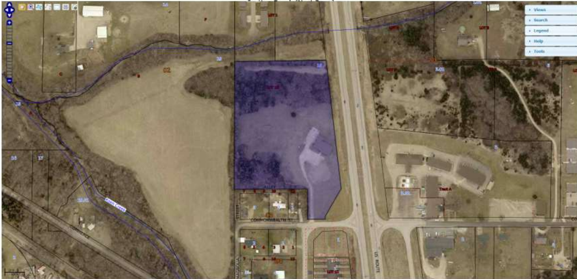
Commonwealth Drive Parcel Map