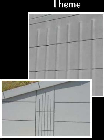
Hampton & Wells Roundabout & Ped/Bike Path