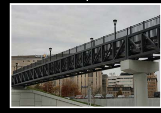
Kingshighway Pedestrian Bridge