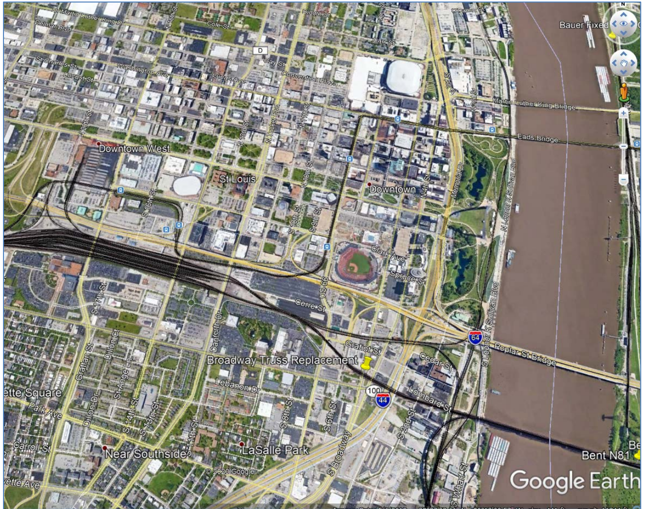
Figure 1 -- Project Location – St. Louis, MO

TRRA is replacing the MacArthur Bridge Broadway Truss in St. Louis, Missouri with a new steel plate girder superstructure and CIP Concrete substructure as shown below. USDOT FRA and TRRA is funding the Project.