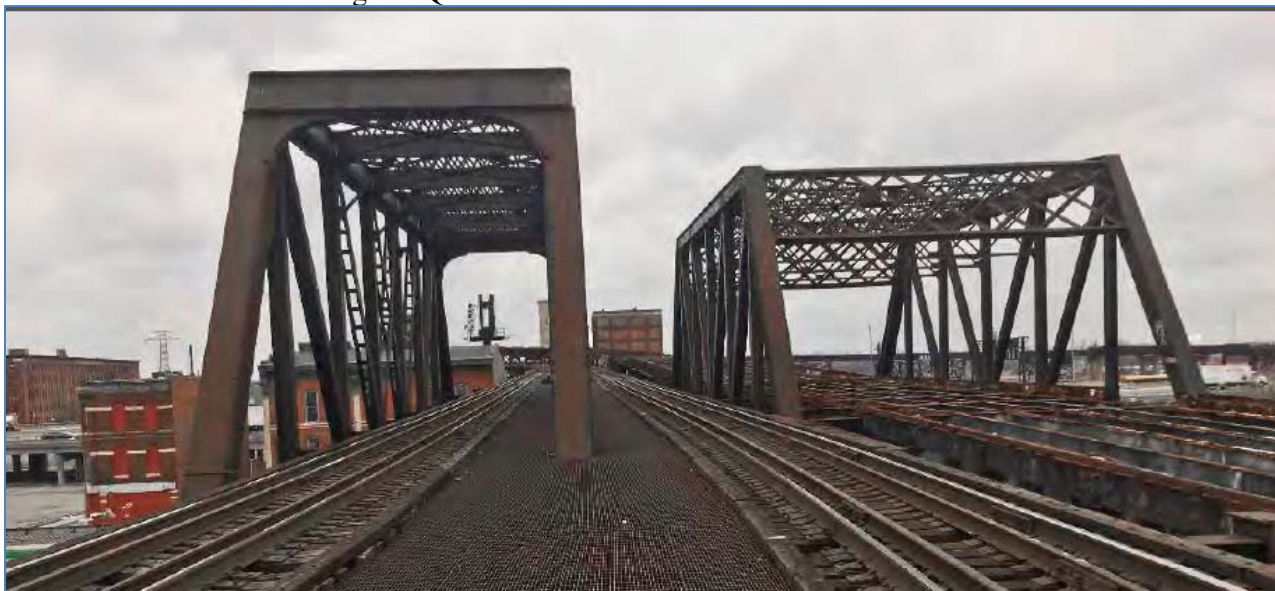
Figure 2 -- Replacement of Existing Trusses