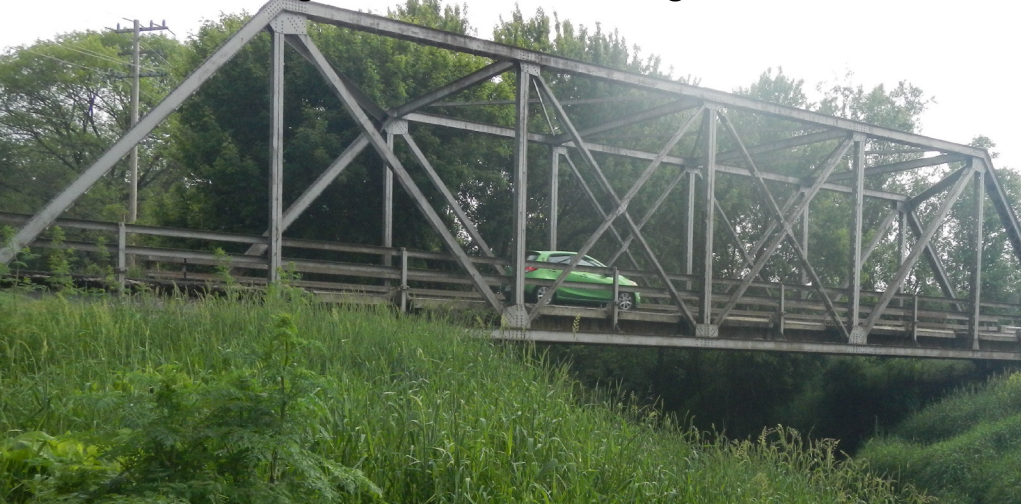
Existing McLean's Branch Bridge