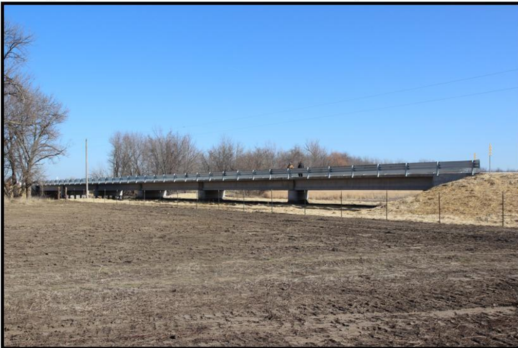
Saline County Bridge #04000181 MoDOT Project BRO-B097(45) 300' Six-Span

90' Single-Span & Mechanical Stabilized Earth Retaining Walls