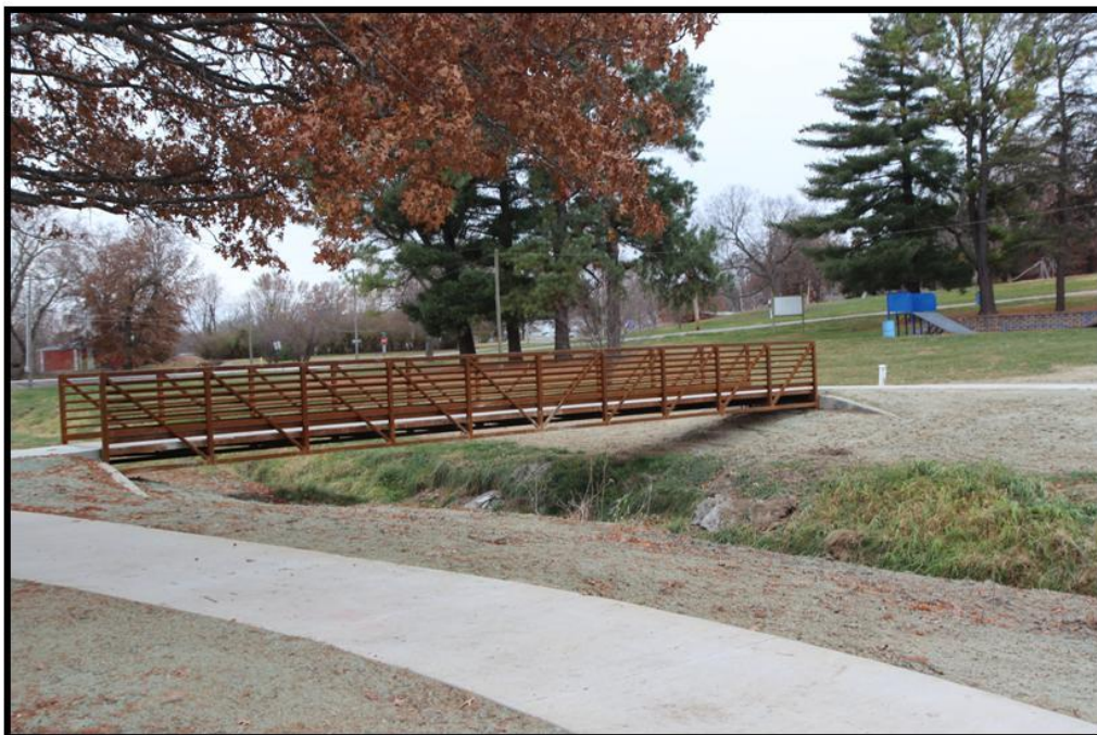
Standley Branch Pedestrian Trail MoDOT Project STP-9900(260) Carrollton, Missouri