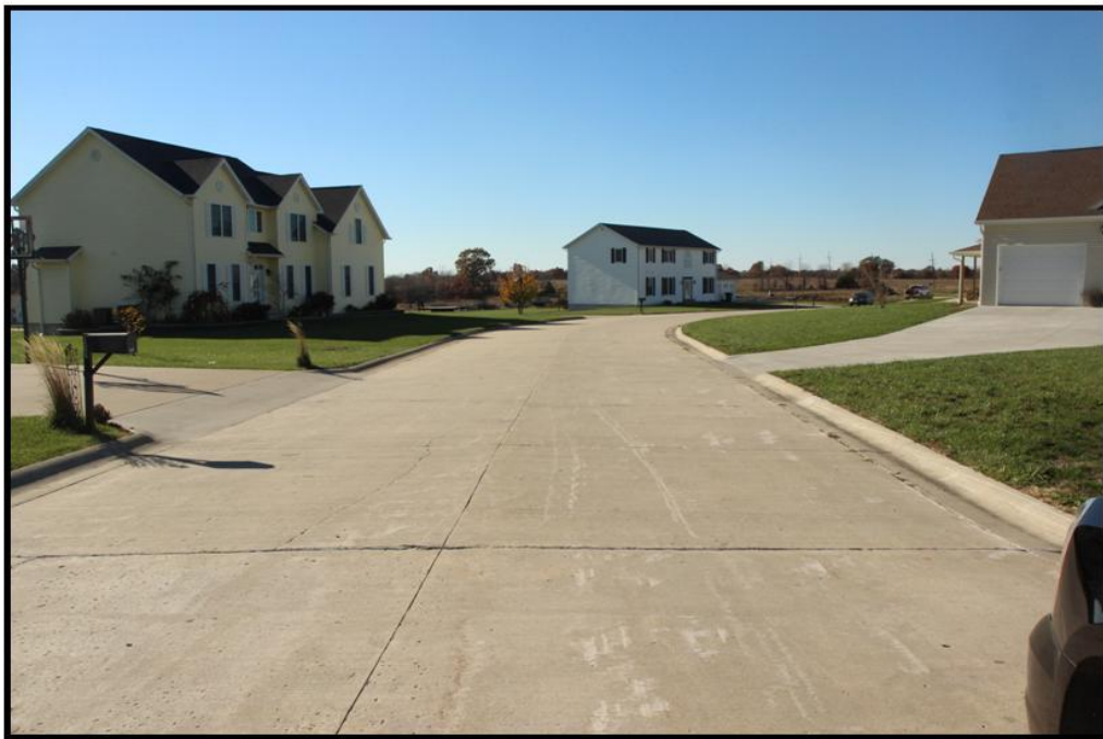
Lakeside Estates Development, Kirksville MO

Roadway: 8" Non-reinforced Concrete, 28' Width, 2' Curb & Gutter, Concrete Barrier Curb Pedestrian Protection