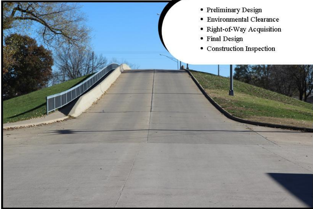
Linn County Bridge #26500011 MoDOT Project BRO-B058(27)

Roadway: 8" Non-reinforced Concrete, 28' Width, 2' Curb & Gutter, Concrete Barrier Curb Pedestrian Protection