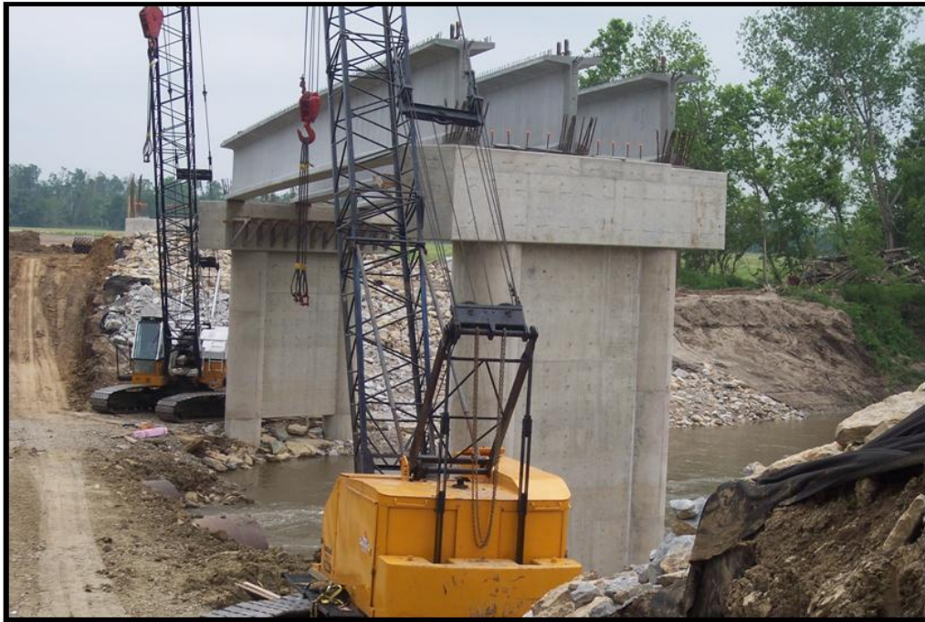
Linn County Bridge #24600071 MoDOT Project BR0-B058(31) 310' Three Span Bridge

RHODES ENGINEERING COMPANY OFFERS COMPLETE LPA CONSTRUCTION INSPECTION SERVICES