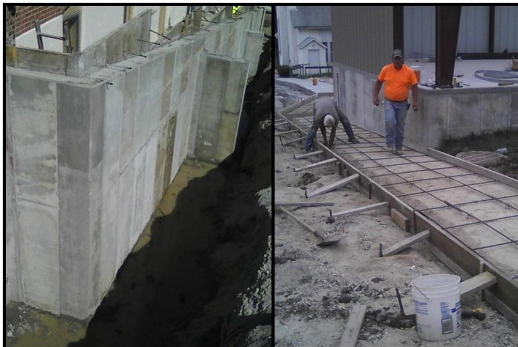
Downtown Revitalization Phase 2 MoDOT Project STP-9900(246) Milan, Missouri