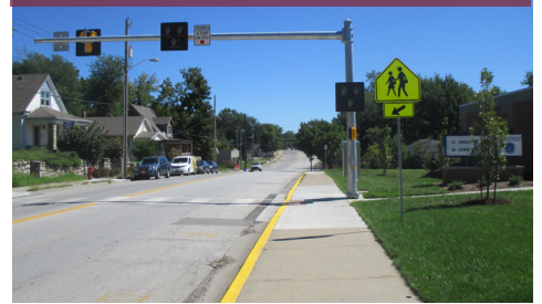
FRANK RUSHTON ELEMENTARY SCHOOL PEDESTRIAN ACCESS - KCK