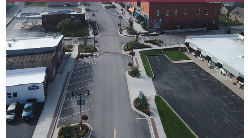
BROADWAY STREET RECONSTRUCTION - LOUISBURG, KS