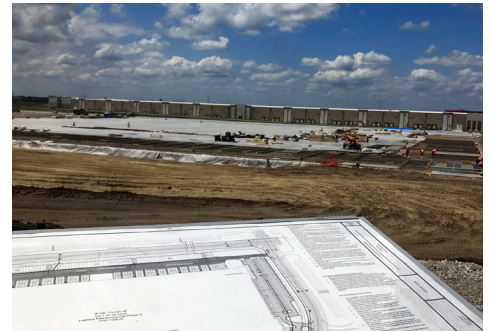
CONSTRUCTION PHASE SERVICES