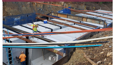
QUIVIRA & PARK STORM DRAINAGE INSPECTION - SHAWNEE, KS