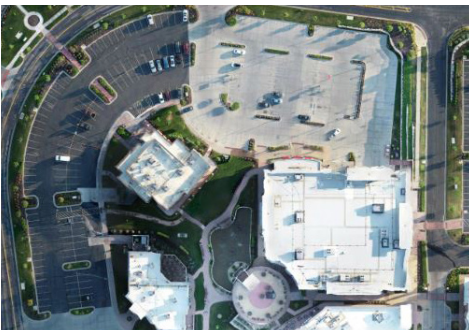
COMMERCIAL DRONE SERVICES