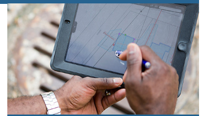
INFRASTRUCTURE + ANALYTICS