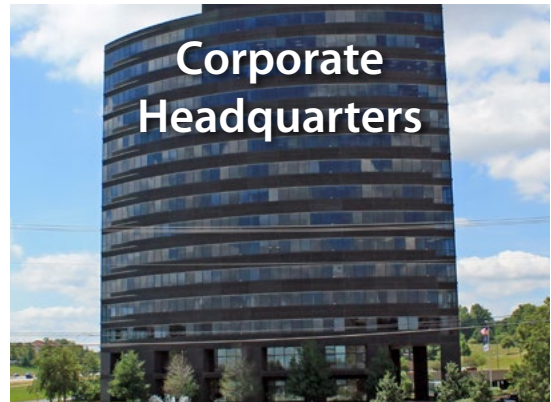
7101 College Blvd., Suite 400 Overland Park, KS 66210 (913) 663-1900

BHC RHODES has landed on numerous fastest growing company lists and has won best place to work honors. Most recently, BHC RHODES earned the title of Top Area Engineering Firms and Largest Engineering Firms in KC by Kansas City Business Journal and Best Firms to Work For by Zweig Group. Future plans include continuing their focus on giving back to the community and support of higher education with the Brungardt Honomichl & Company, P.A., engineering scholarship program at Kansas State University.