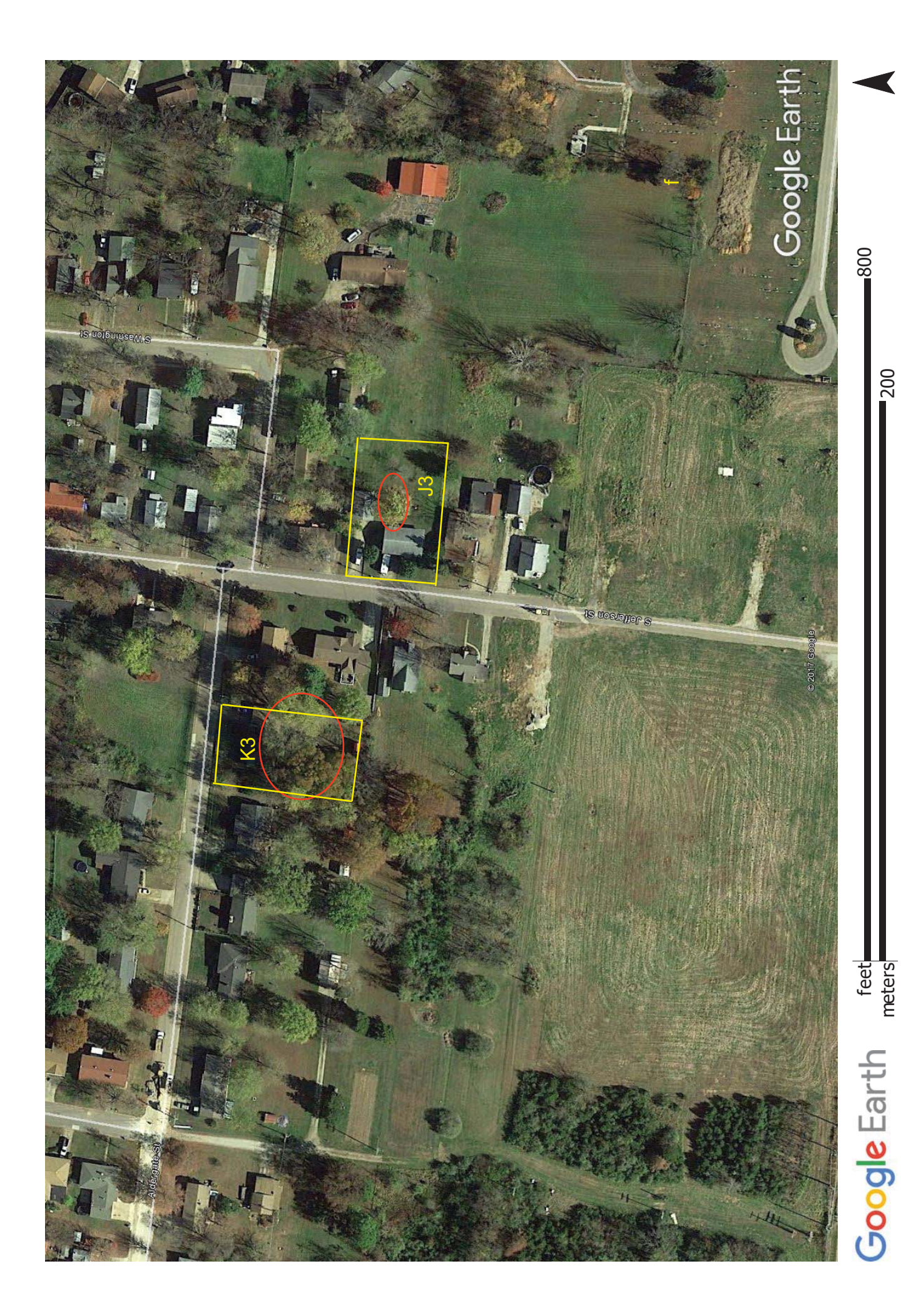
THIS PHOTO IN NO WAY REPRESENTS THE CURRENT PROPERTY BOUNDARIES AND IS MEANT AS A REFERENCE ONLY. PHOTO NOT TO SCALE.