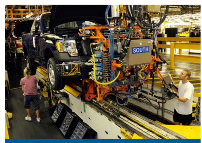
Approximately 7,000 workers at the Ford Kansas City Assembly Plant rely on equipment, parts and machinery that arrive via I-70 to maintain the plant's status as the largest car manufacturing plant in the nation.

employs 7,000 workers and relies on the uninterrupted flow of automotive supplies along this important artery, as do many manufacturers throughout the region. On the other side of the state near St. Louis, General Motors employs approximately 4,600 employees at its GM Wentzville, Missouri Assembly Plant. Not only does I-70 bring the materials required to assemble Ford trucks and GM's full-size vans, the Chevrolet Express and GMC Savana, and countless other types of equipment, it also helps bring assembled products and agricultural goods from other manufacturers and producers to retailers and distribution hubs. Nearly all of the top 100 freight generators within Missouri are located along the I-70 corridor.