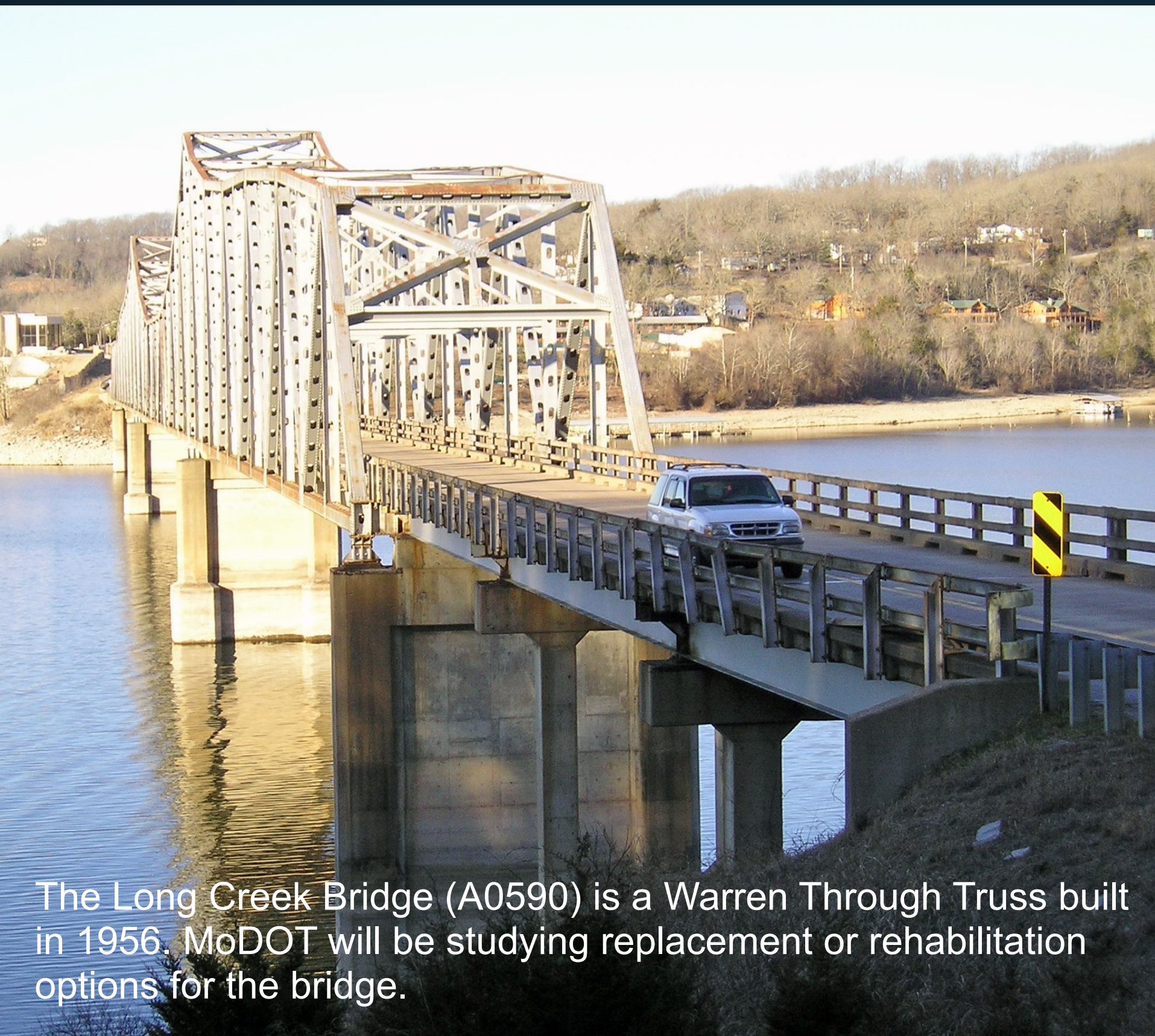
The Long Creek Bridge (A0590) is a Warren Through Truss built in 1956. MoDOT will be studying replacement or rehabilitation options for the bridge.

The Missouri Department of Transportation (MoDOT) is analyzing options for replacement or rehabilitation of the Long Creek Bridge on Route 86 in Taney County, Missouri.