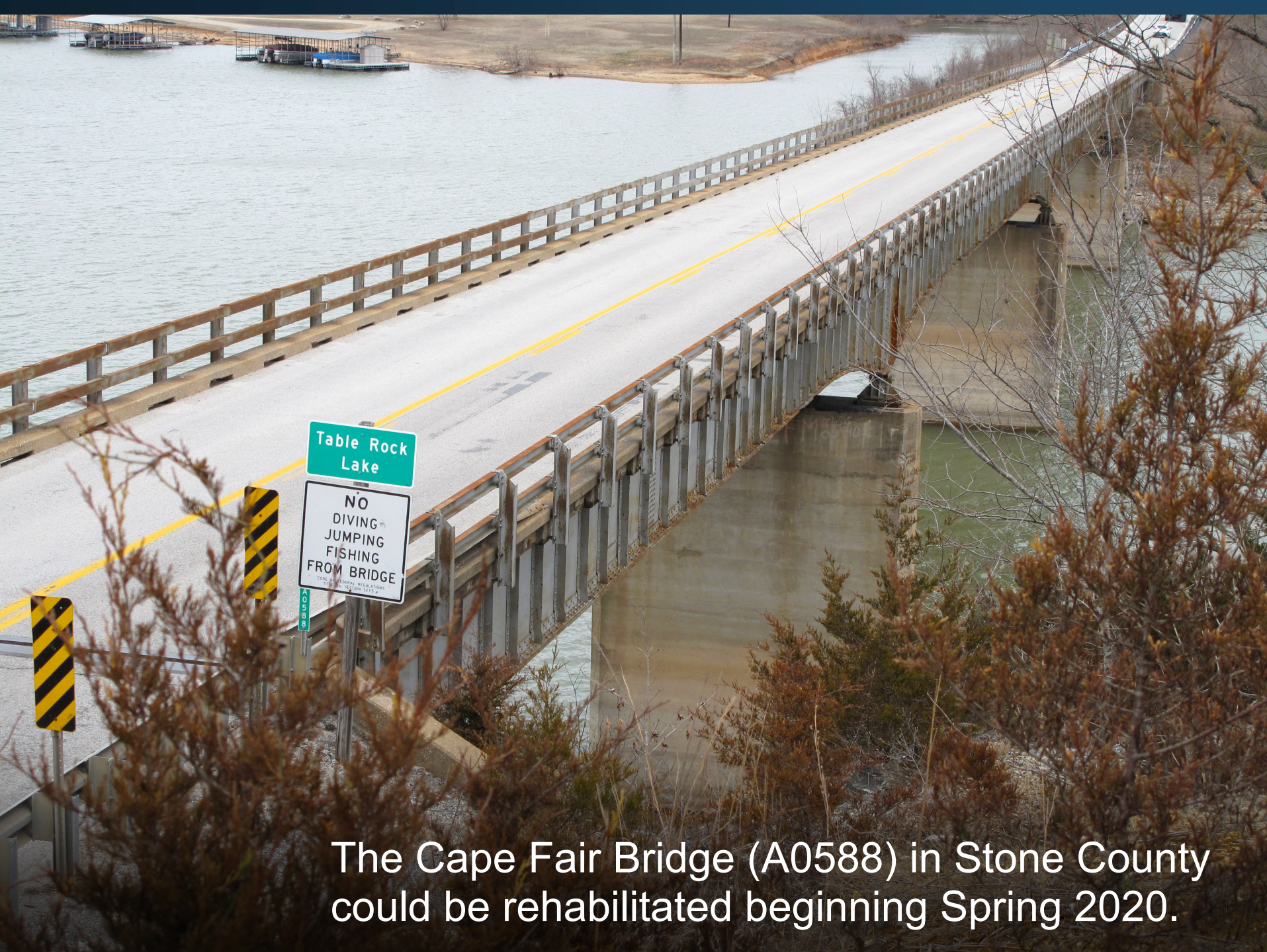
The Cape Fair Bridge (A0588) in Stone County could be rehabilitated beginning Spring 2020.