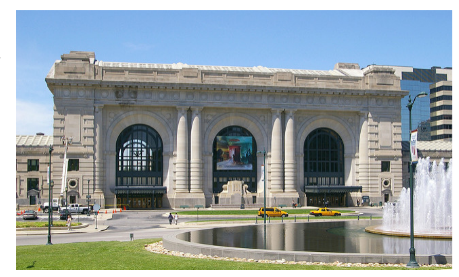
Union Station, Kansas City, MO