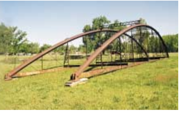
The Georgia City Bridge after being moved to Webb City where it will eventually cross a small stream in King Jack Park.

These bridges primarily were evaluated in terms of their historical and technological significance. Structural integrity also was considered. When one of these bridges has to be replaced, whether it's owned by a county, city or the state, some crucial decisions have to be made.