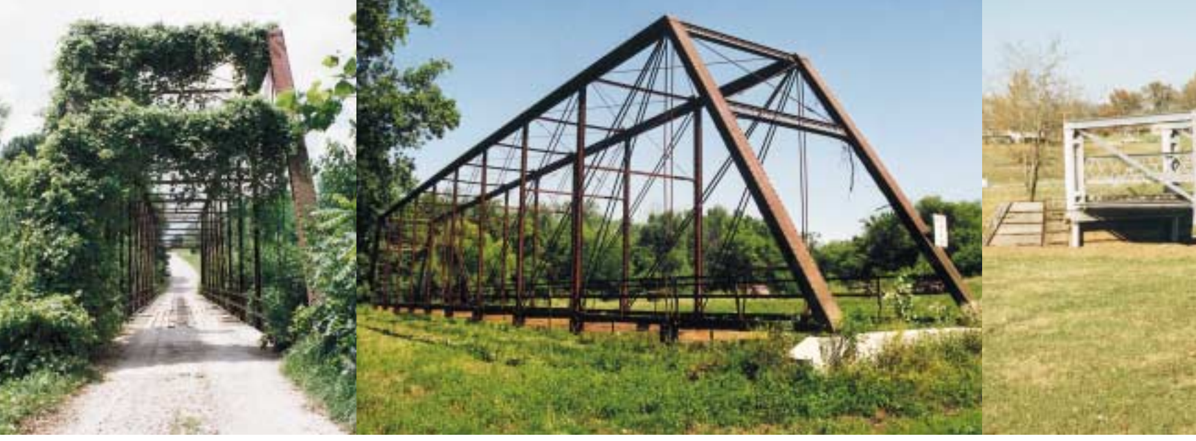
The Bonanza Bridge in Caldwell County before adaptive reuse.