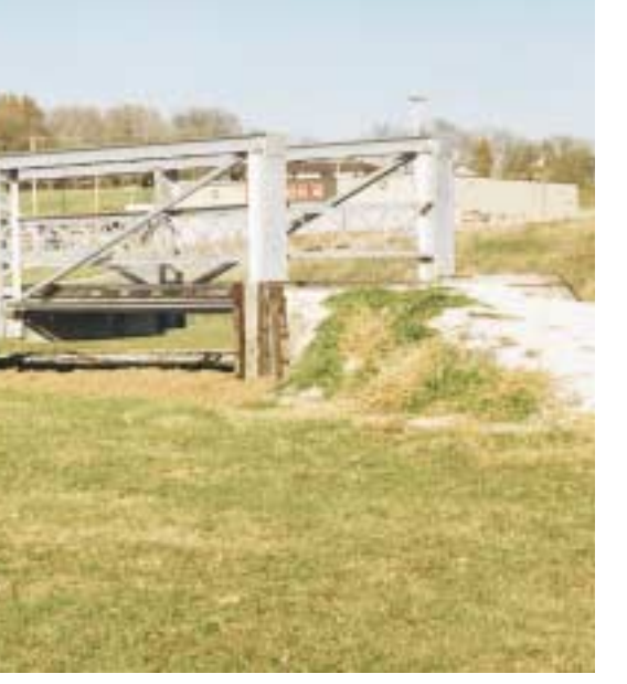
This 15-foot bridge in Carroll County is one of the smallest structures saved by the program.

center of the park. When it's completed, visitors will be able to follow a zigzag pathway over the bridges, viewing displays that describe the history and significance of each one.