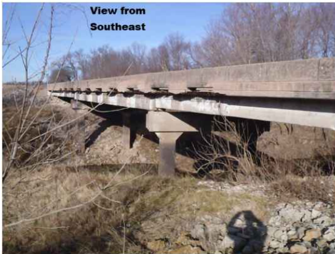
View from Southeast