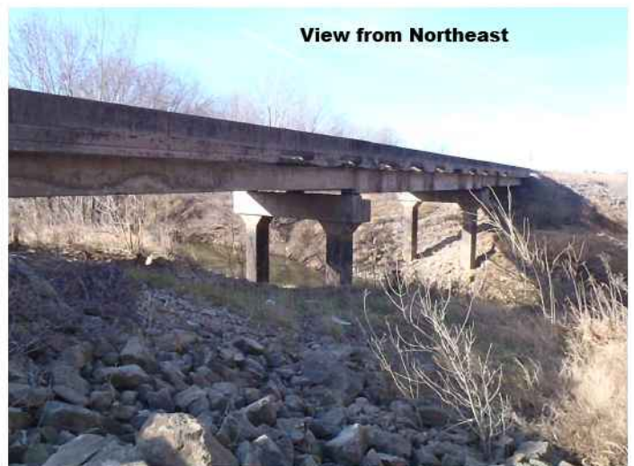
View from Northeast