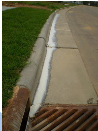
Evidence of an Illicit Discharge