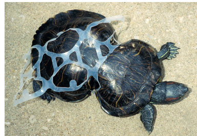
The dangers of littering