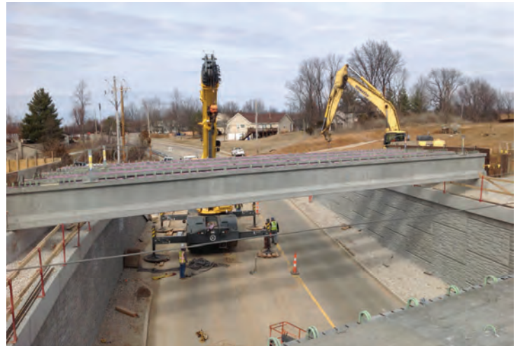
Crews work on the new Motherhead Road bridge.