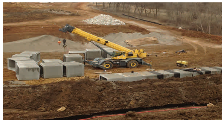
Box culvert being worked on at Motherhead Road.