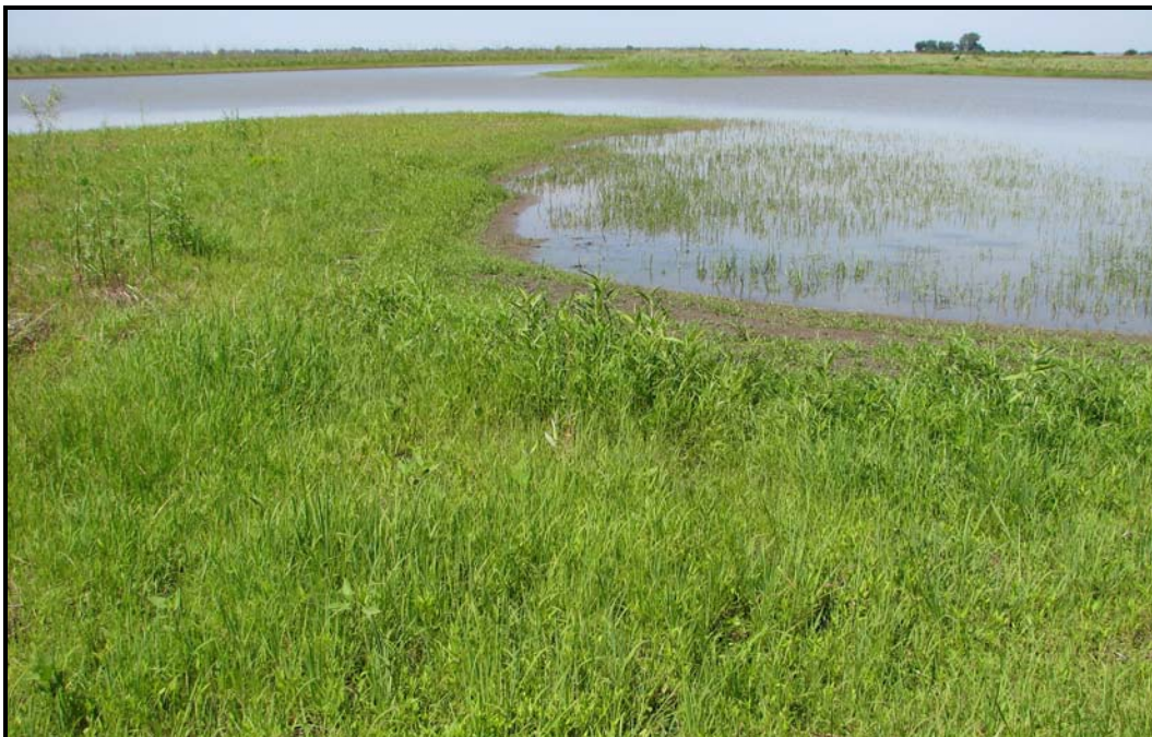
Photo 18. From northeastern corner of site, facing west. (June 13, 2006)