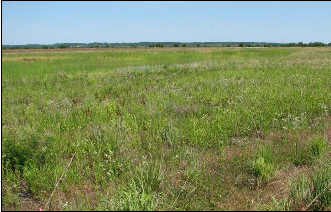
Photo 9. From southeastern corner of western leg of site, facing northwest. (June 13, 2006)