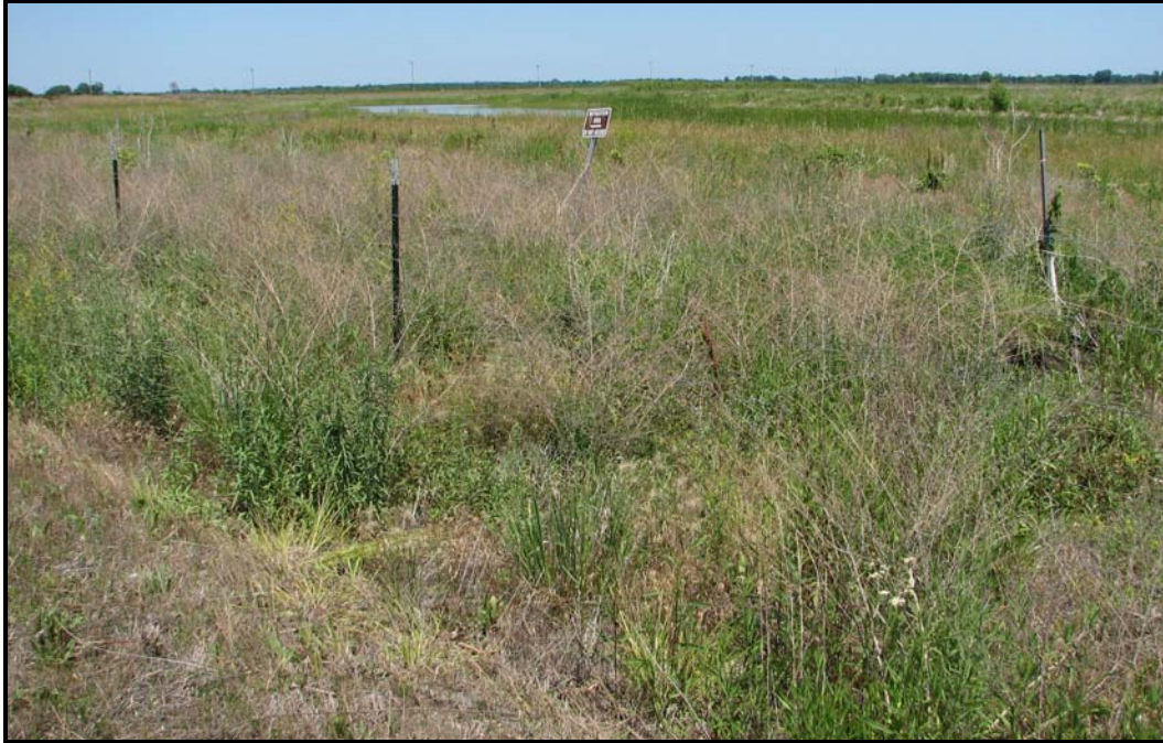
Photo 11. From western border of site, facing east. (June 13, 2006)