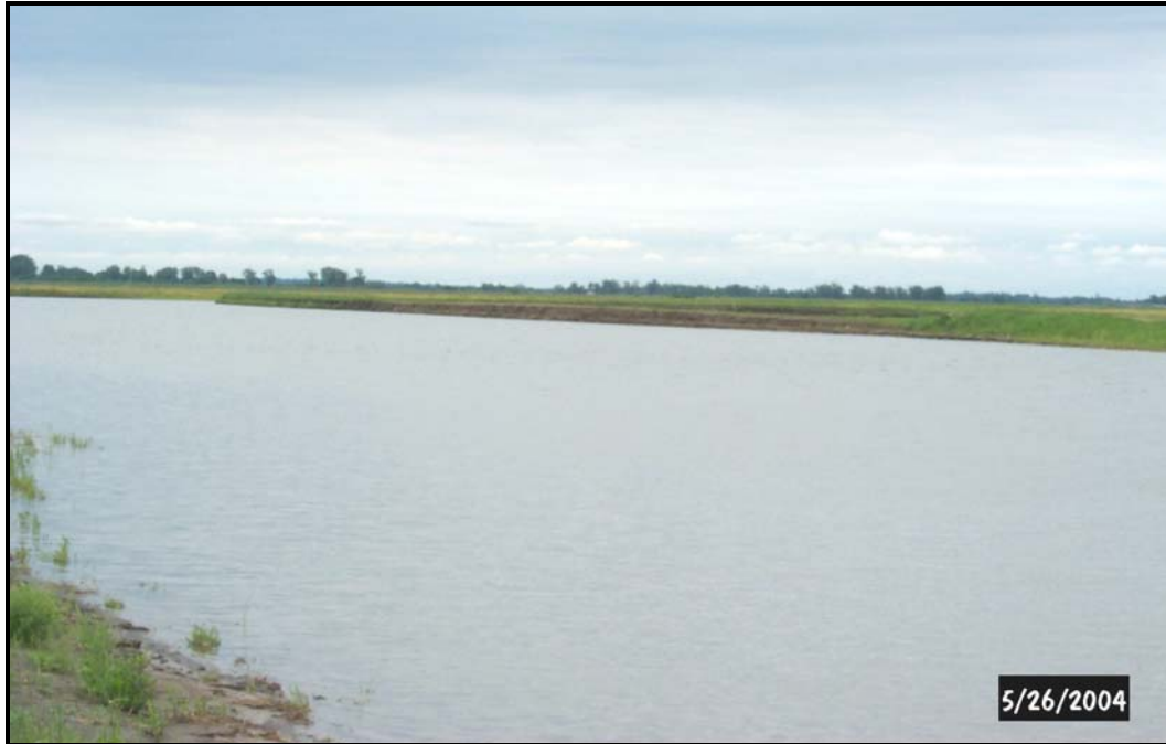
Photo 5. Northern open water portion of site, facing southeast. (May 26, 2004)