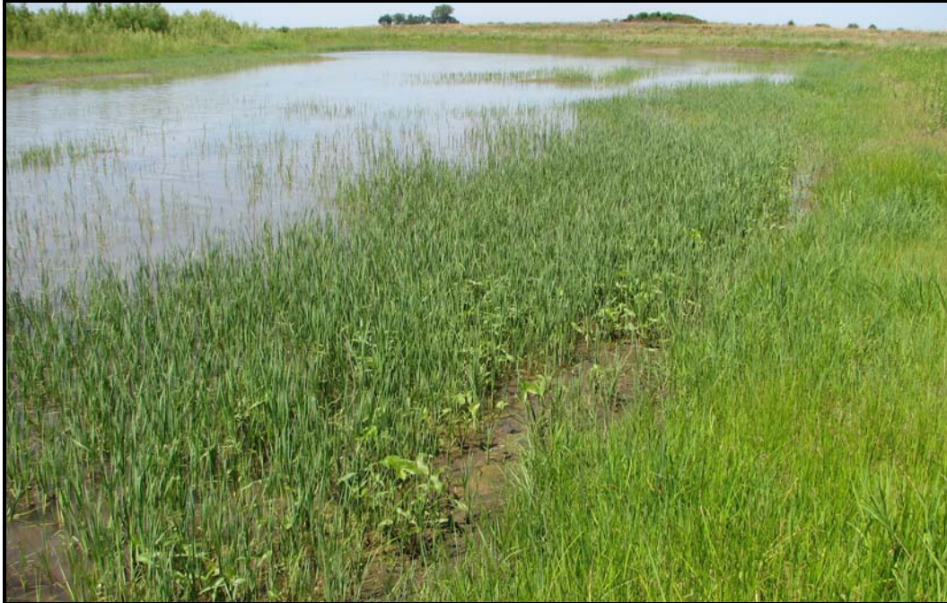
Photo 15. Northwestern portion of site, facing west. (June 13, 2006)