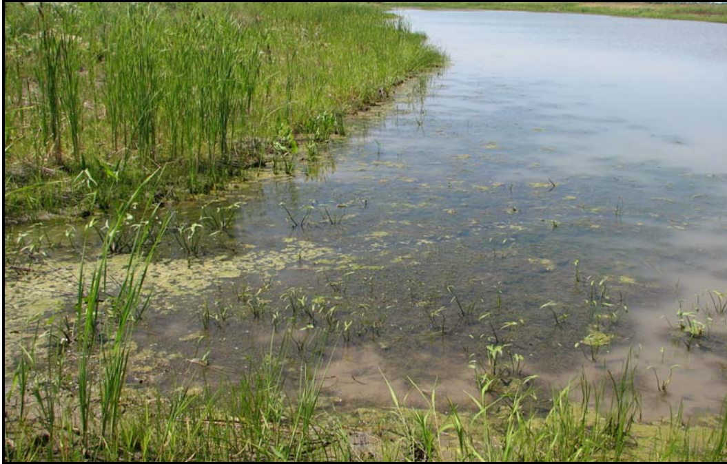
Photo 13. Northwestern corner of site, facing south. (June 13, 2006)