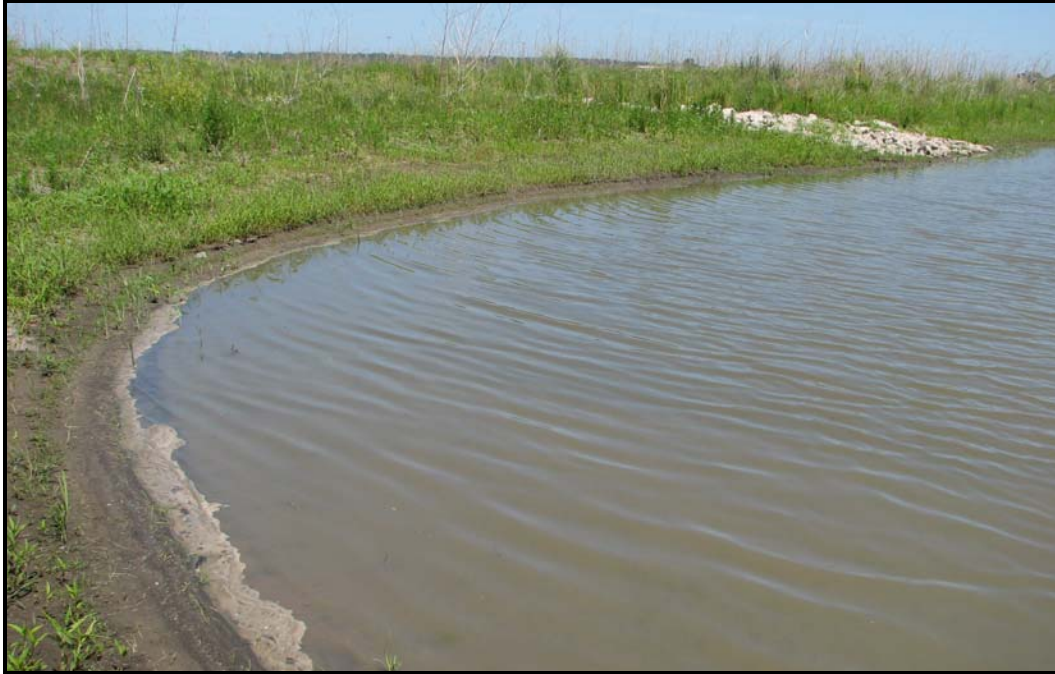
Photo 19. Eastern leg of site, facing northwest toward weir. (June 13, 2006)