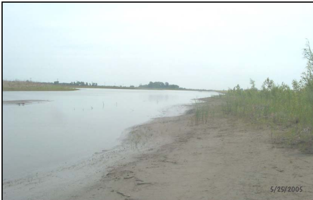
Photo 6. Along edge of berm following repairs, facing east. (May 25, 2005)