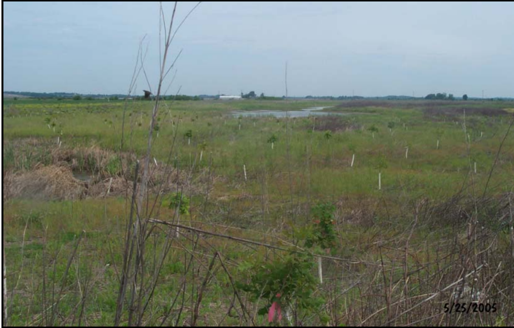
Photo 7. Southern portion of site with installed trees, facing north. (May 25, 2005)