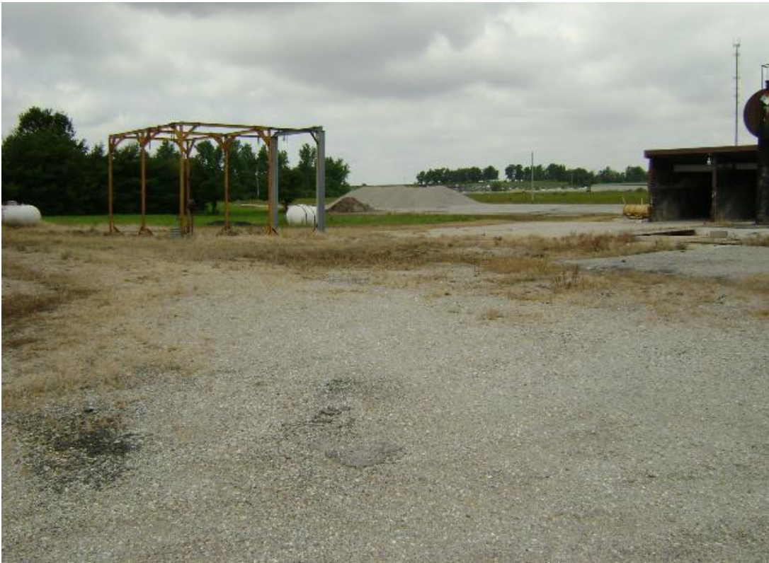
Overall area behind the equipment service building (viewing southwest)