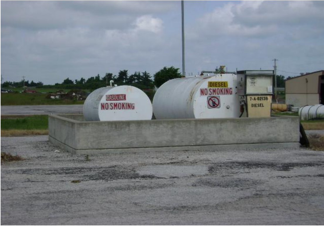
Fuel tanks and concrete containment area