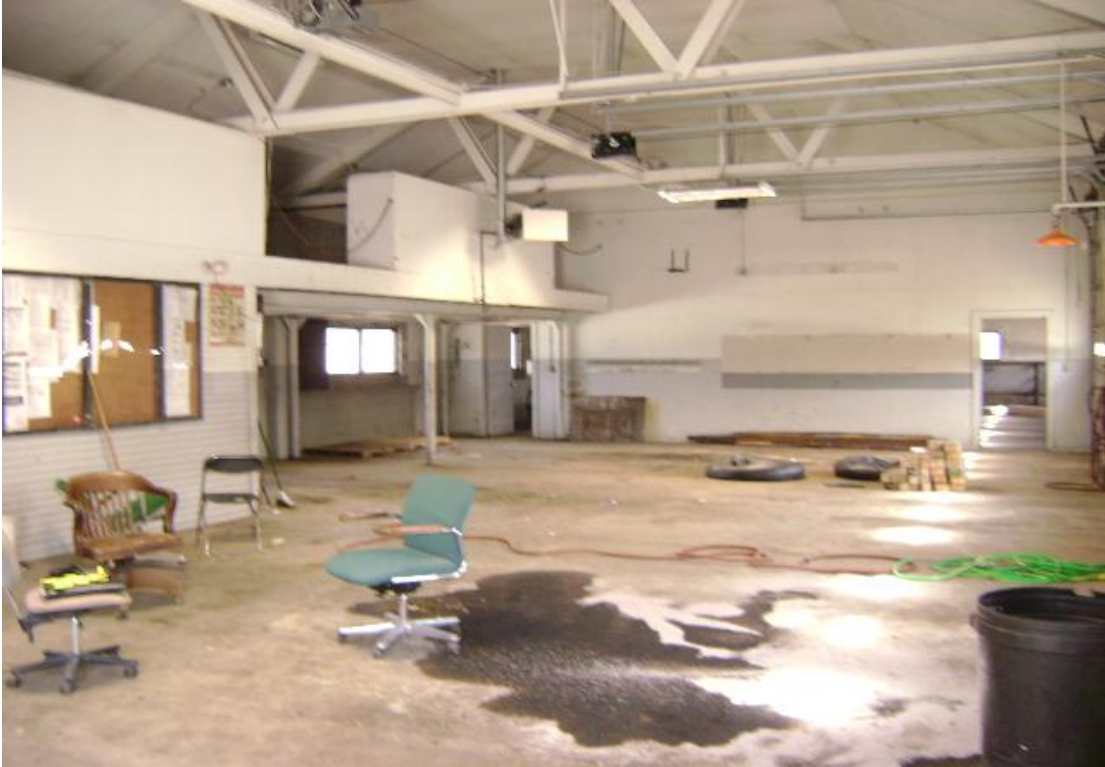
Interior of equipment building (south side)