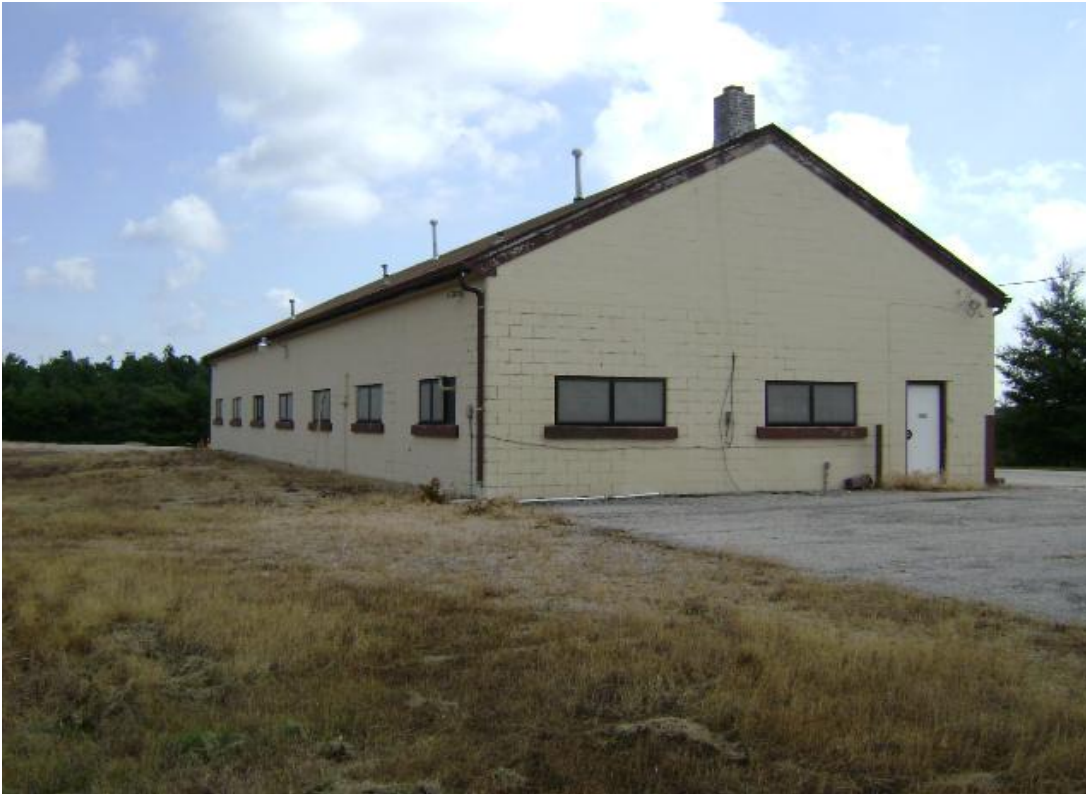
Equipment service building (viewing northeast)