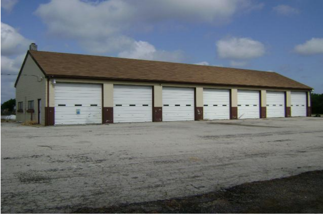
Equipment service building (viewing west)