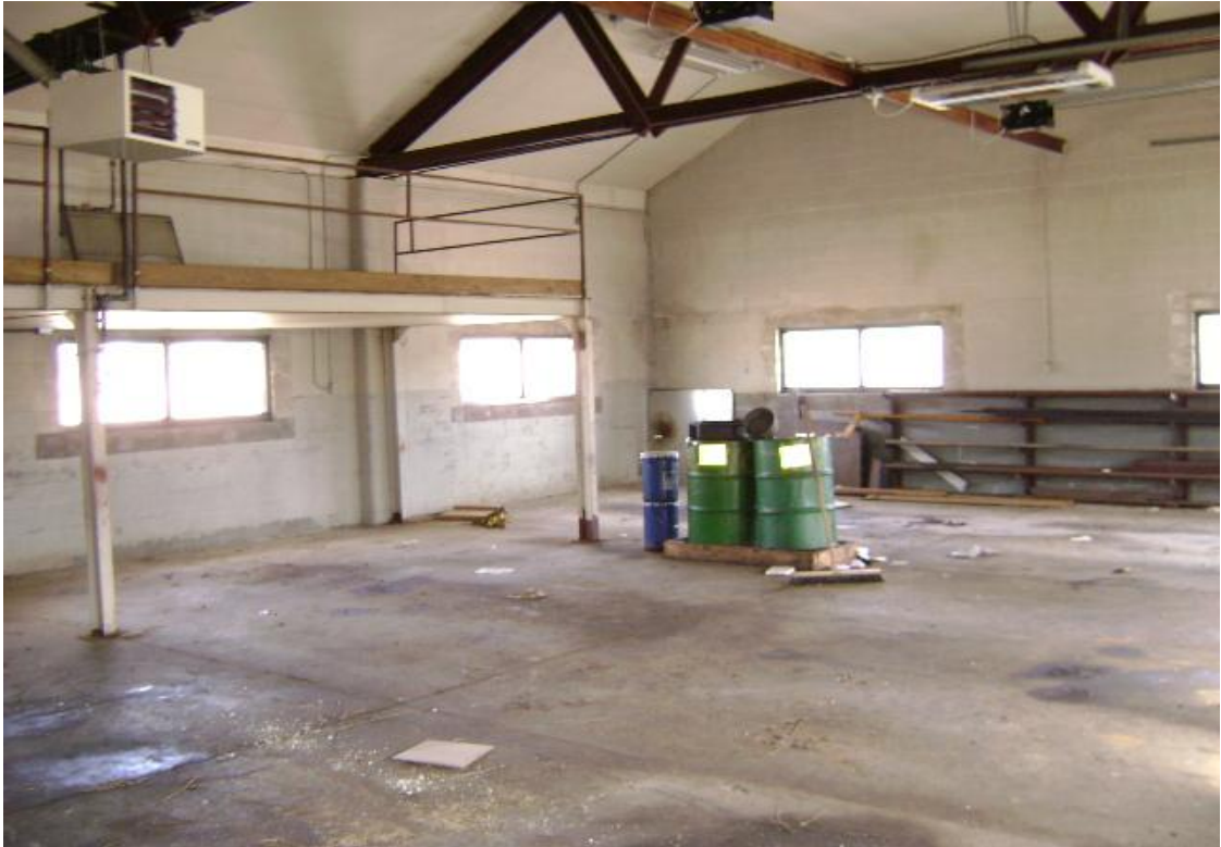
Interior of equipment building (north side)