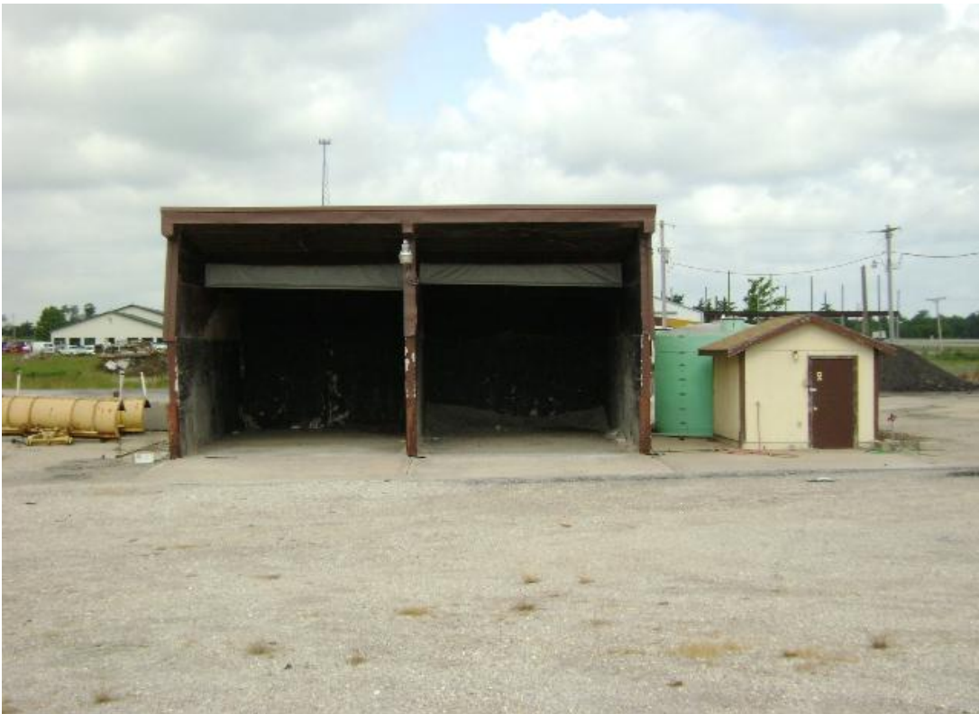
Material shed, storage building and chloride tank (viewing west)