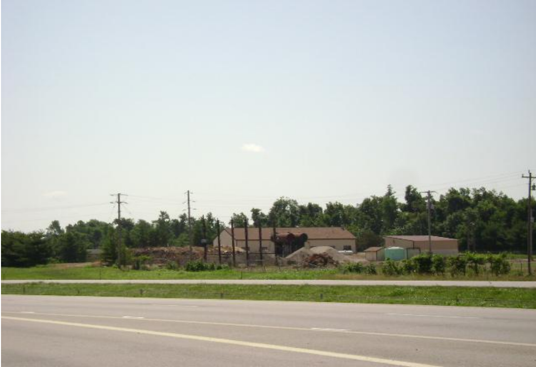
(viewing southeast from I-44)