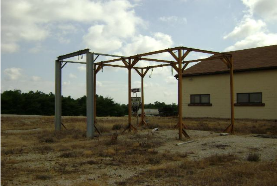
Spreader hanger located west of equipment building (viewing northeast)