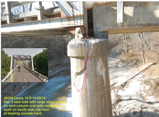
J0359 Lewis 16 E 11/20/14 Pier 3 east side with large shear crack on east column end with medium spall on south side cap face at bearing sounds hard