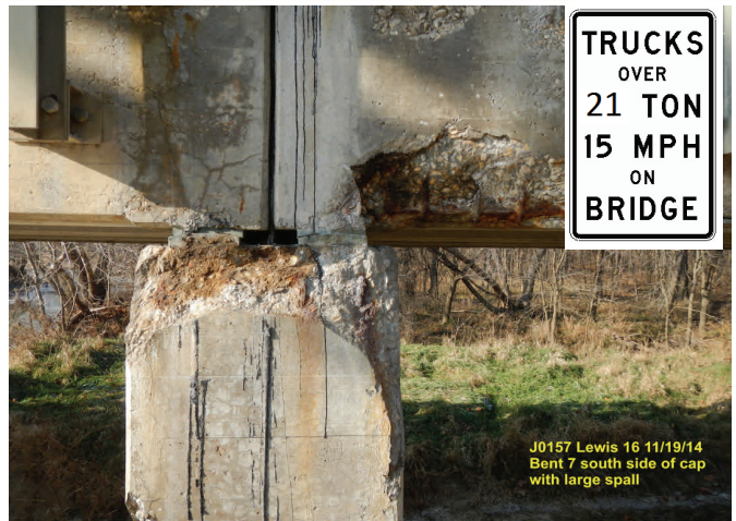
J0157 Lewis 16 11/19/14 Bent 7 south side of cap with large spall

Exterior concrete girders and bearings/pier caps are pressing concerns so we need to get the load to the interior of the bridge. Bridge is 84 years old