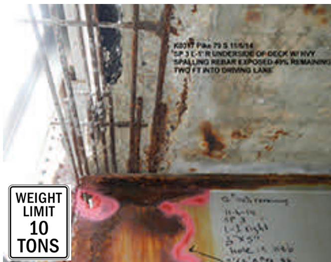
K0307 Pike 79 S 11/1/14 SP 3 L-1" R UNDERSIDE OF DECK W/ RIVY SPALLING REBAR EXPOSED 4% REMAINING TWO FT INTO DRIVING LANE

TRUCKS OVER 14 TON 15 MPH ON BRIDGE EXCEPT MAX. WEIGHT LIMIT SINGLE UNIT 21 TON OTHERS 37 TON