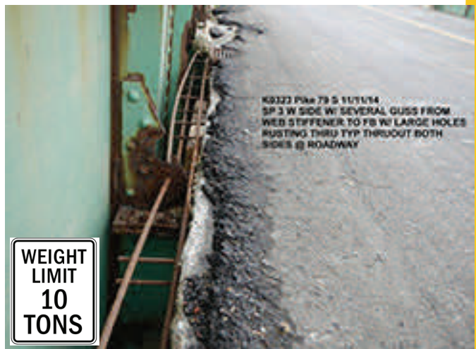
K0322 Pike 79 S 11/1/14 SP 3 W SIDE W SEVERAL GUSSES FROM WEB STIFFENER TO FB W/ LARGE HOLES RUSTING THRU TYP THROUGH BOTH SIDES @ ROADWAY

north of Clarksville Nov. 19, 2014—Weight Limit Reduced to 10 Tons. Regular inspection revealed continued deterioration. Bridge is 79 years old