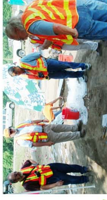
Tribal consultation at the Carskadon Site (23Le348)