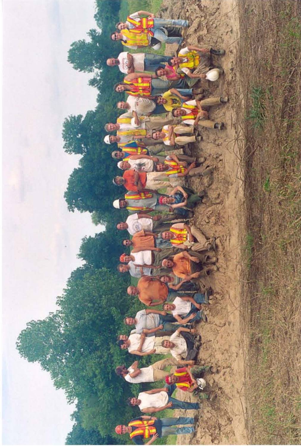
The Summer 2005 Crew of the Avenue of the Saints Archaeological Investigations.

The Logsdon Fan Site (23Ck59) was located on the banks of a prehistoric stream channel where the archaeological deposits have been deeply buried by alluvial processes. This Early Archaic site is composed of several small activity areas that probably represent short-term visits to the site by a small group of people. These activities appear to be centered around hearths and activities focusing on stone tool maintenance and production. One interesting artifact type recovered at the site is a hafted end scraper. These teardrop-shaped scrapers would most likely have been used for hide working. Wood charcoal from one of the hearths was radiocarbon dated to Cal BC 8260 to 7960. Given the extreme age of this camp site, the archaeological data obtained during excavations will provide rare glimpses into the lifeways of early hunters and gatherers.