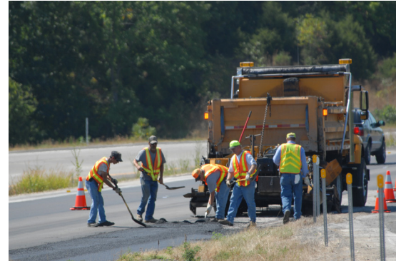
Maintenance crews have been taking advantage of milder temperatures to work on activities typically done when spring arrives, such as pothole repair, culvert replacement, litter control, among other activities.

Other items that usually don’t see much attention until well into spring are also getting an early start. Culvert repairs on many of our rural routes are in full swing. Fencing and ditch work, replacing signs and litter control also topped the list. We have had an early start on items that typically kick off in spring. Mother Nature has been very polite this season, and we continue to take advantage of her generosity.