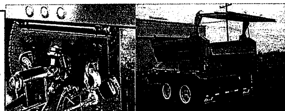
Pintle hook and rigging Half round with bed liner

Bed liners - note: we keep them in stock!