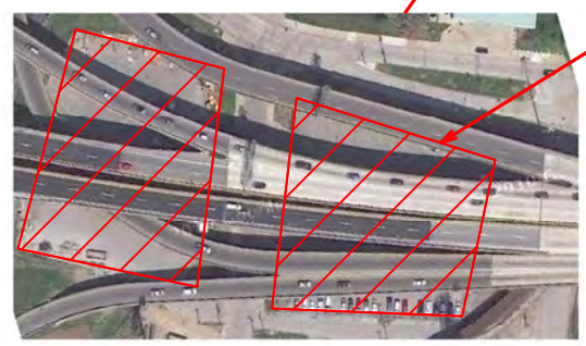
AVAILABLE STAGING AREA