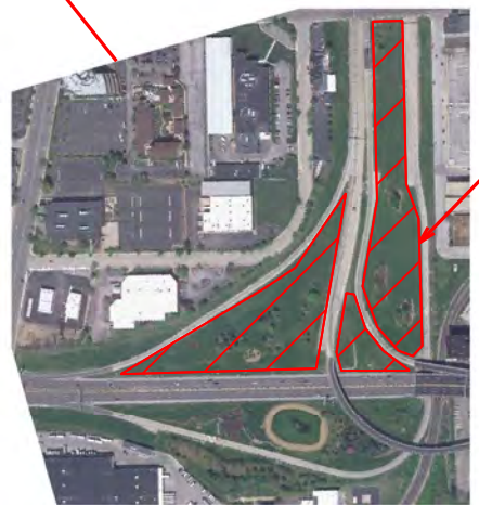
AVAILABLE STAGING AREA